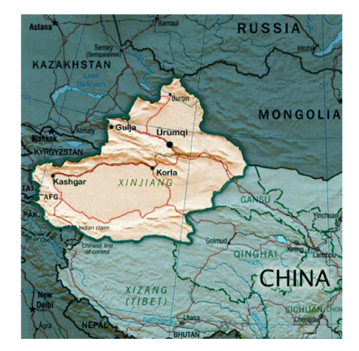
Figure 1: Map of Xinjiang and surrounding regions (Xinjiang, 2010b)

The XUAR covers 1/6<sup>th</sup> of China's territory and is geographically both fruitful and strategic. It borders with Russia, Mongolia, Kazakhstan, Kyrgyzstan, Tajikistan, Pakistan, India, Afghanistan and one of China's other trouble spots, Tibet. This inevitably makes Xinjiang act as a "buffer" and become China's gateway to Asia (Drake et al., 2009, pp39). The resources hidden beneath the deserts and mountains of this area account for 40% of China's coal reserves, 21% of China's gas reserves and 17% of China's oil reserves (Drake et al., 2009, pp43). For a country developing as quickly as China, pulling billions of people out of poverty, this land is priceless.