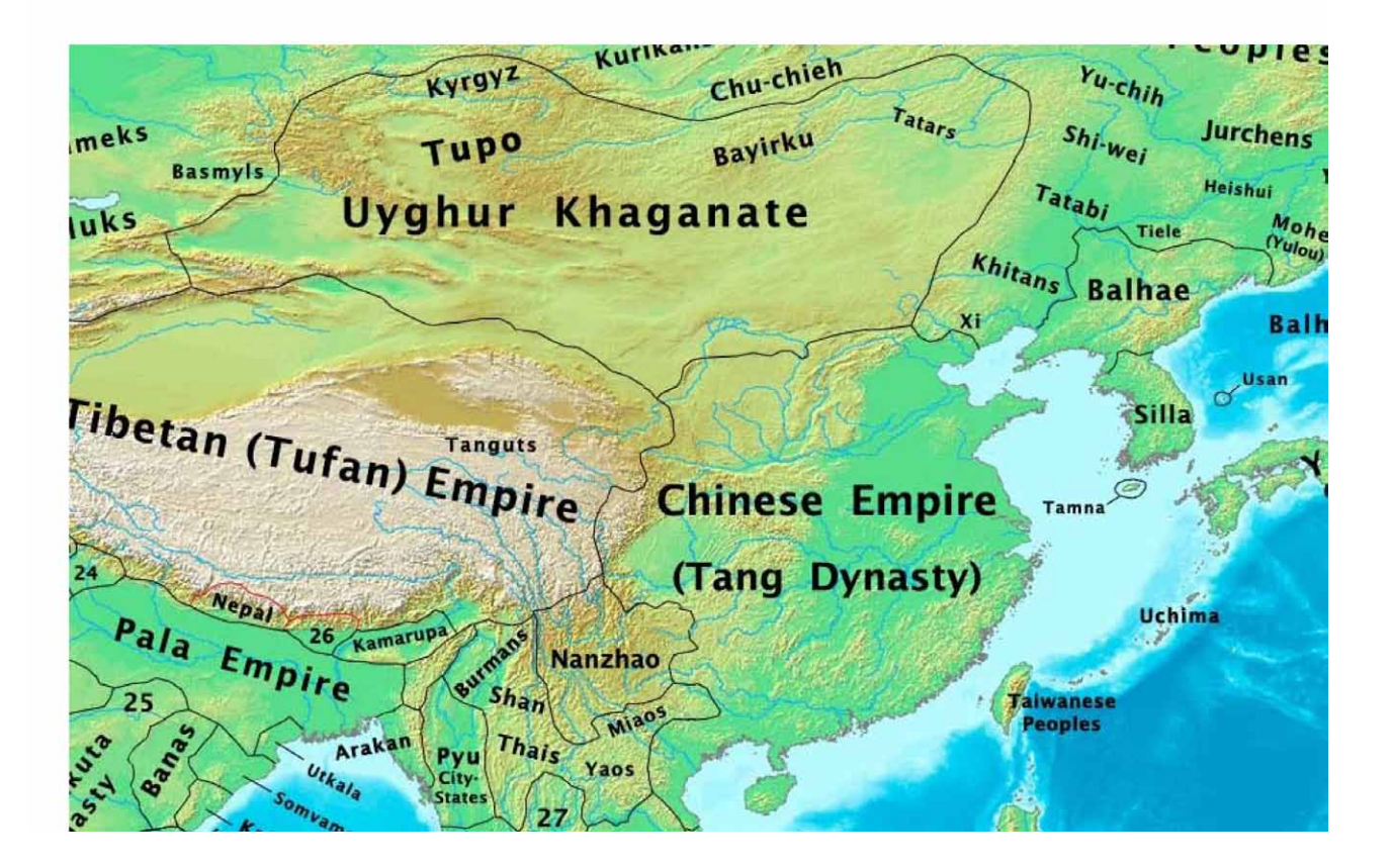
Figure 5: Map of Uighur Empire c.800CE (Lessman, 2008)